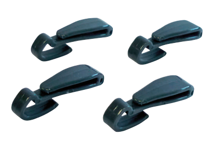
Replacement headlamp holder clips for the Skylor helmet (4 pcs).