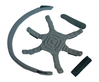
Replacement padding kit for the Skylor helmet.