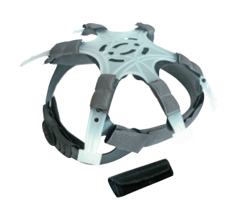
Replacement head band system for the Skylor helmet.