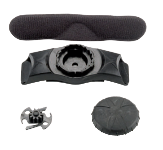
Replacement turn dial adjustment kit for Skylor, Armour Work.