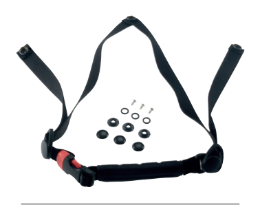
Replacement chin strap kit for the Skylor helmet.